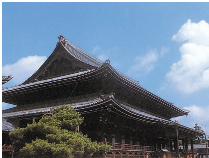
A view of the Founder's Hall from the southeast.

This is the most important place in the temple complex, where the image of the founder Shinran is enshrined. It is the center of worship for the Shinshū Ōtani-ha branch of Shin Buddhism. This hall is located at the center of the precincts and is one of the largest wooden structures in the world, being 76 m (250 ft.) in length, 58 m (190 ft.) in width, 38 m (125 ft.) in height.